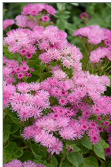
Bumble Rose Flossflower flowers

Bumble Rose Flossflower is recommended for the following landscape applications;