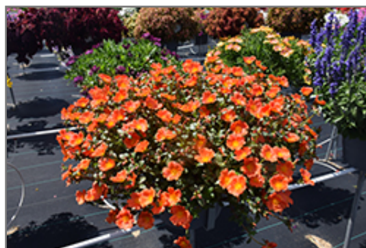
Mega Pazzaz Orange Portulaca in bloom