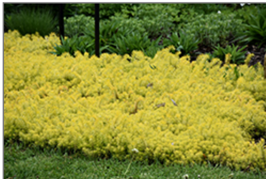
Angelina Stonecrop

This plant does best in full sun to partial shade. It prefers dry to average moisture levels with very well-drained soil, and will often die in standing water. It is considered to be drought-tolerant, and thus makes an ideal choice for a low-water garden or xeriscape application. It is not particular as to soil pH, but grows best in poor soils, and is able to handle environmental salt. It is highly tolerant of urban pollution and will even thrive in inner city environments. This is a selected variety of a species not originally from North America. It can be propagated by division; however, as a cultivated variety, be aware that it may be subject to certain restrictions or prohibitions on propagation.