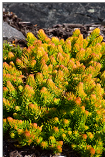
Angelina Stonecrop foliage