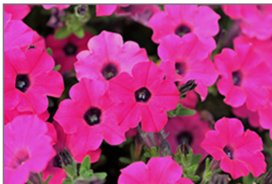
Itsy Magenta Petunia flowers