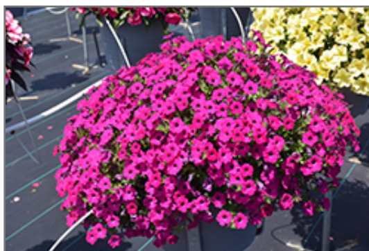
Itsy Magenta Petunia in bloom