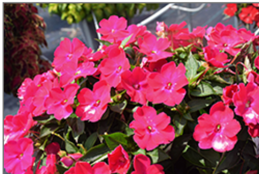
SunPatiens Compact Rose Glow New Guinea Impatiens flowers

SunPatiens Compact Rose Glow New Guinea Impatiens is recommended for the following landscape applications;