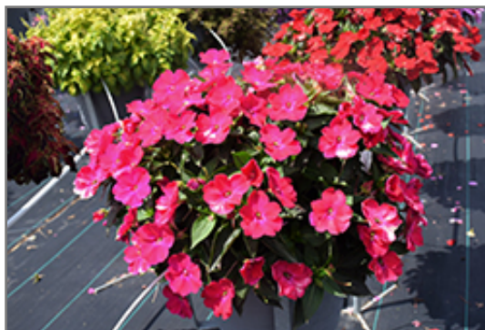
SunPatiens Compact Rose Glow New Guinea Impatiens in bloom

SunPatiens Compact Rose Glow New Guinea Impatiens is a fine choice for the garden, but it is also a good selection for planting in outdoor containers and hanging baskets. It can be used either as 'filler' or as a 'thriller' in the 'spiller-thriller-filler' container combination, depending on the height and form of the other plants used in the container planting. It is even sizeable enough that it can be grown alone in a suitable container. Note that when growing plants in outdoor containers and baskets, they may require more frequent waterings than they would in the yard or garden.