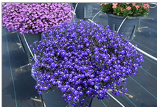
Techno Upright Cobalt Blue Lobelia in bloom