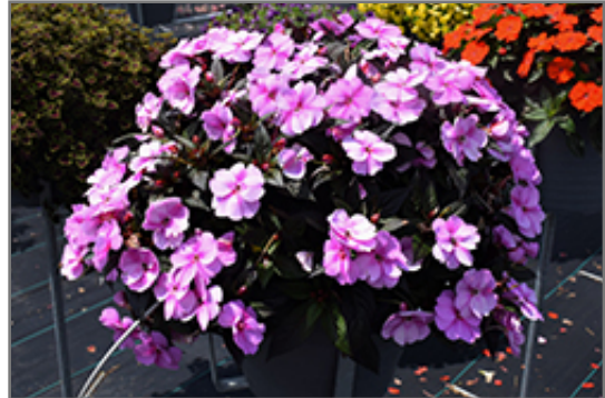
SunPatiens Vigorous Lavender Splash New Guinea Impatiens in bloom

SunPatiens Vigorous Lavender Splash New Guinea Impatiens is a fine choice for the garden, but it is also a good selection for planting in outdoor containers and hanging baskets. Because of its height, it is often used as a 'thriller' in the 'spiller-thriller-filler' container combination; plant it near the center of the pot, surrounded by smaller plants and those that spill over the edges. It is even sizeable enough that it can be grown alone in a suitable container. Note that when growing plants in outdoor containers and baskets, they may require more frequent waterings than they would in the yard or garden.