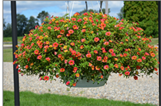
Cabaret Diva Orange Calibrachoa in bloom

Cabaret Diva Orange Calibrachoa is a fine choice for the garden, but it is also a good selection for planting in outdoor containers and hanging baskets. Because of its trailing habit of growth, it is ideally suited for use as a 'spiller' in the 'spiller-thriller-filler' container combination; plant it near the edges where it can spill gracefully over the pot. Note that when growing plants in outdoor containers and baskets, they may require more frequent waterings than they would in the yard or garden.