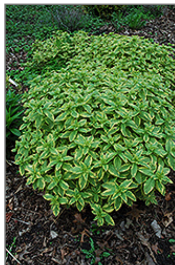
Golden Alexander Loosestrife