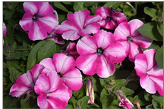
Headliner Raspberry Star flowers