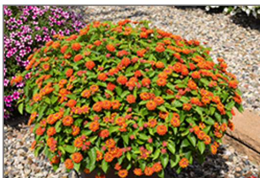
Hot Blooded Red Lantana in bloom