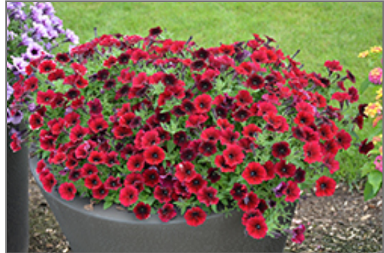
Supertunia Black Cherry Petunia in bloom

Supertunia Black Cherry Petunia is a fine choice for the garden, but it is also a good selection for planting in outdoor containers and hanging baskets. Because of its trailing habit of growth, it is ideally suited for use as a 'spiller' in the 'spiller-thriller-filler' container combination; plant it near the edges where it can spill gracefully over the pot. Note that when growing plants in outdoor containers and baskets, they may require more frequent waterings than they would in the yard or garden.