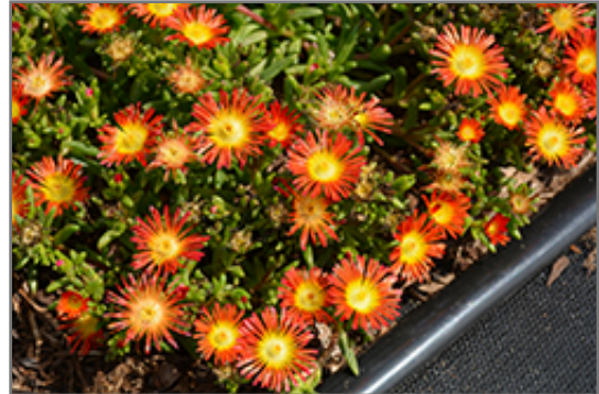
Delmara Red Ice Plant flowers

Delmara Red Ice Plant will grow to be only 4 inches tall at maturity extending to 6 inches tall with the flowers, with a spread of 15 inches. When grown in masses or used as a bedding plant, individual plants should be spaced approximately 12 inches apart. Its foliage tends to remain low and dense right to the ground. It grows at a fast rate, and under ideal conditions can be expected to live for approximately 5 years. As an evergreen perennial, this plant will typically keep its form and foliage year-round.