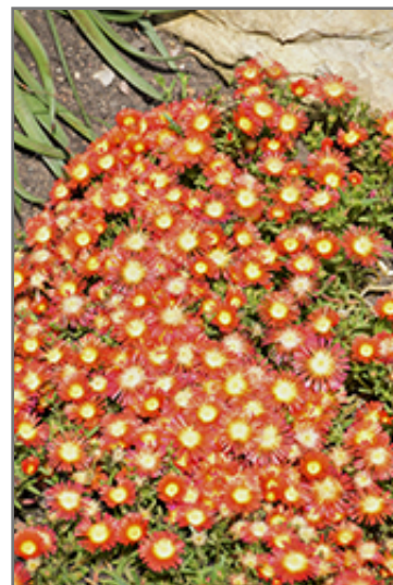
Delmara Red Ice Plant

Delmara Red Ice Plant is recommended for the following landscape applications;