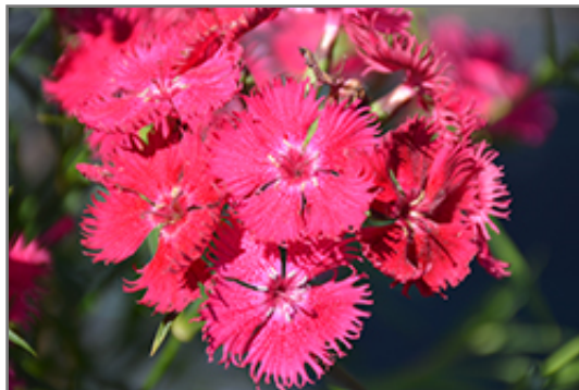
Rockin' Rose Pinks flowers

Rockin' Rose Pinks is recommended for the following landscape applications;