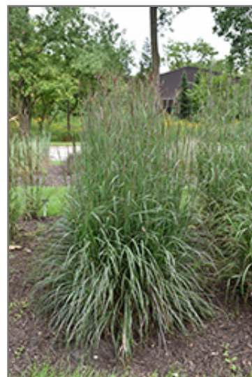
Blackhawks Bluestem in bloom