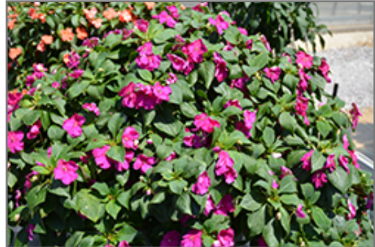
Beacon Violet Shades Impatiens in bloom

Beacon Violet Shades Impatiens will grow to be about 15 inches tall at maturity, with a spread of 12 inches. When grown in masses or used as a bedding plant, individual plants should be spaced approximately 8 inches apart. Its foliage tends to remain dense right to the ground, not requiring facer plants in front. This fast-growing annual will normally live for one full growing season, needing replacement the following year.