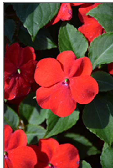
Beacon Bright Red Impatiens flowers