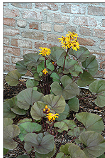
Britt Marie Crawford Rayflower in bloom