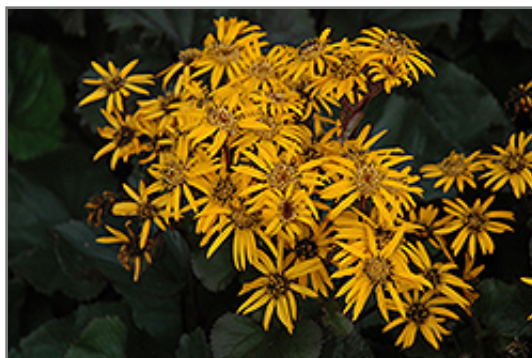
Britt Marie Crawford Rayflower flowers