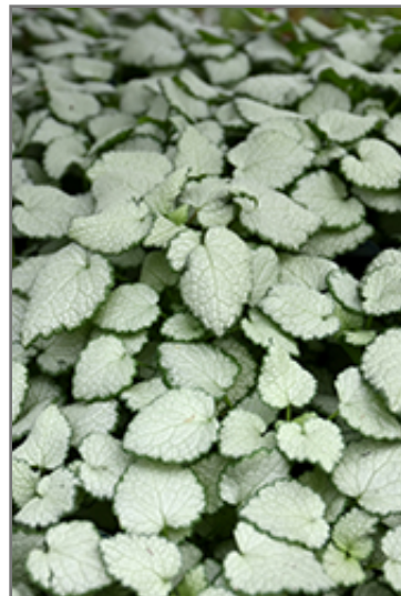
Red Nancy Spotted Dead Nettle foliage

Red Nancy Spotted Dead Nettle is a fine choice for the garden, but it is also a good selection for planting in outdoor pots and containers. Because of its spreading habit of growth, it is ideally suited for use as a 'spiller' in the 'spiller-thriller-filler' container combination; plant it near the edges where it can spill gracefully over the pot. Note that when growing plants in outdoor containers and baskets, they may require more frequent waterings than they would in the yard or garden.