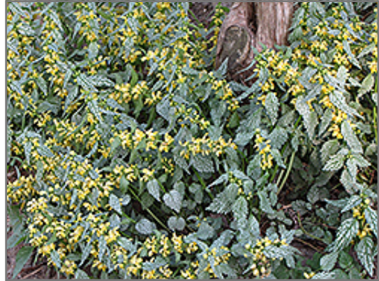
Hermann's Pride Yellow Archangel in bloom

This plant does best in partial shade to shade. It is an amazingly adaptable plant, tolerating both dry conditions and even some standing water. It is considered to be drought-tolerant, and thus makes an ideal choice for a low-water garden or xeriscape application. It is not particular as to soil type or pH. It is highly tolerant of urban pollution and will even thrive in inner city environments. This is a selected variety of a species not originally from North America. It can be propagated by division; however, as a cultivated variety, be aware that it may be subject to certain restrictions or prohibitions on propagation.