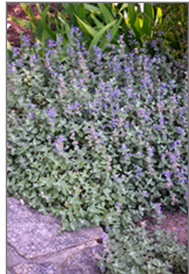
Early Bird Catmint in bloom