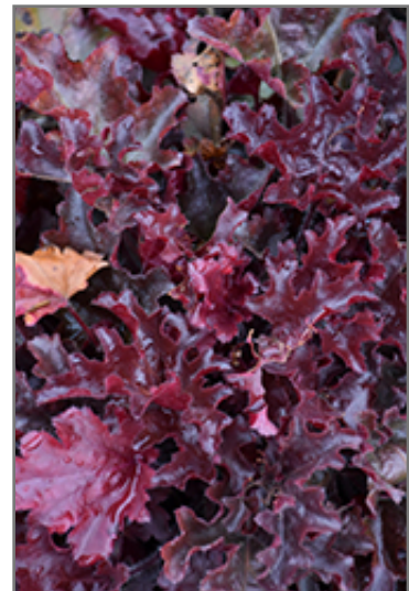
Dolce Cherry Truffles Coral Bells foliage