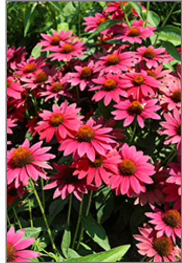
Sombrero Tres Amigos Coneflower flowers

Sombrero Tres Amigos Coneflower is recommended for the following landscape applications;