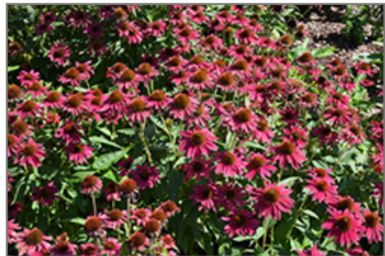
Sombrero Tres Amigos Coneflower in bloom