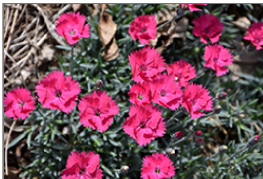
Paint The Town Magenta Pinks flowers