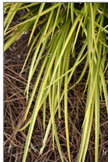
EverColor Everoro Japanese Sedge foliage