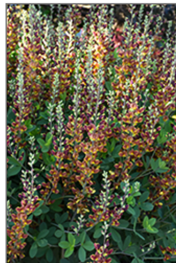
Decadence Cherries Jubilee False Indigo flowers

* This is a 'special order' plant - contact store for details