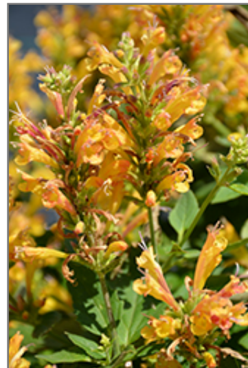
Poquito Butter Yellow Hyssop flowers