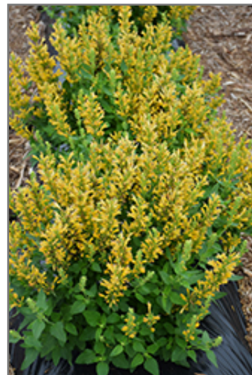
Poquito Butter Yellow Hyssop in bloom