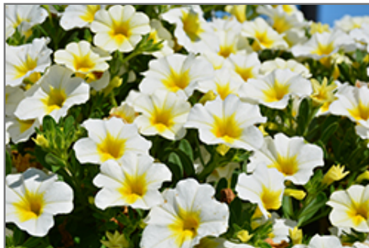
MiniFamous Neo White + Yellow Eye Calibrachoa flowers

This plant will require occasional maintenance and upkeep. Trim off the flower heads after they fade and die to encourage more blooms late into the season. It is a good choice for attracting bees and hummingbirds to your yard, but is not particularly attractive to deer who tend to leave it alone in favor of tastier treats. It has no significant negative characteristics.