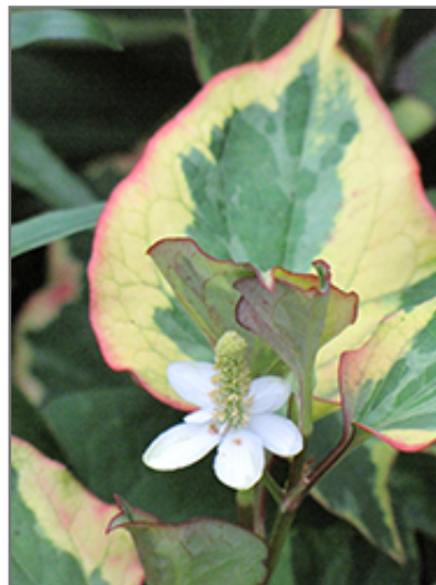
Chameleon Houttuynia flowers