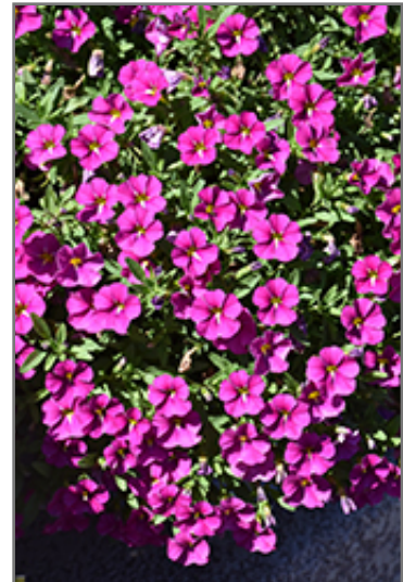
Cabaret Pink Star Calibrachoa flowers

Cabaret Pink Star Calibrachoa is recommended for the following landscape applications;