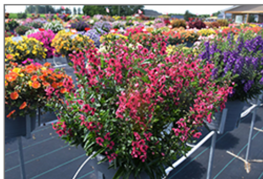
Archangel Cherry Red Angelonia in bloom