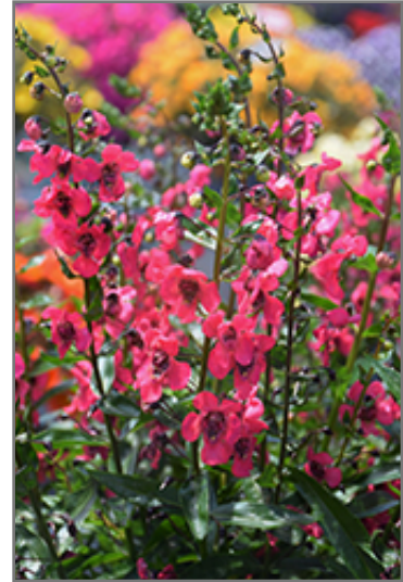
Archangel Cherry Red Angelonia flowers

Archangel Cherry Red Angelonia is a fine choice for the garden, but it is also a good selection for planting in outdoor containers and hanging baskets. It is often used as a 'filler' in the 'spiller-thriller-filler' container combination, providing a mass of flowers against which the larger thriller plants stand out. Note that when growing plants in outdoor containers and baskets, they may require more frequent waterings than they would in the yard or garden.