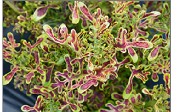
Under The Sea Red Coral Coleus foliage

Under The Sea Red Coral Coleus is recommended for the following landscape applications;