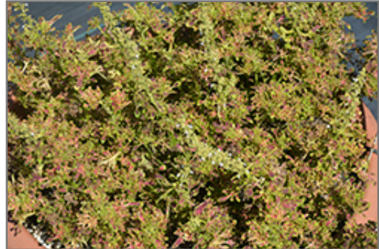
Under The Sea Red Coral Coleus foliage

Under The Sea Red Coral Coleus will grow to be about 20 inches tall at maturity, with a spread of 24 inches. When grown in masses or used as a bedding plant, individual plants should be spaced approximately 20 inches apart. Although it's not a true annual, this fast-growing plant can be expected to behave as an annual in our climate if left outdoors over the winter, usually needing replacement the following year. As such, gardeners should take into consideration that it will perform differently than it would in its native habitat.