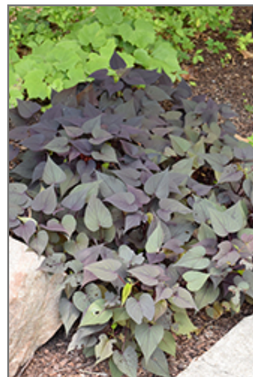
Sweet Georgia Heart Purple Sweet Potato Vine