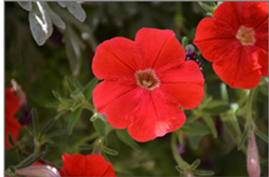
Supertunia Really Red Petunia flowers

Supertunia Really Red Petunia is recommended for the following landscape applications;