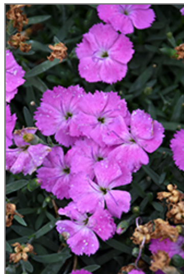
Paint The Town Fuchsia Pinks flowers

Paint The Town Fuchsia Pinks is recommended for the following landscape applications;