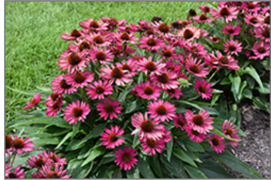
Kismet Raspberry Coneflower in bloom

Kismet Raspberry Coneflower will grow to be about 16 inches tall at maturity, with a spread of 24 inches. Its foliage tends to remain dense right to the ground, not requiring facer plants in front. It grows at a fast rate, and under ideal conditions can be expected to live for approximately 10 years. As an herbaceous perennial, this plant will usually die back to the crown each winter, and will regrow from the base each spring. Be careful not to disturb the crown in late winter when it may not be readily seen!