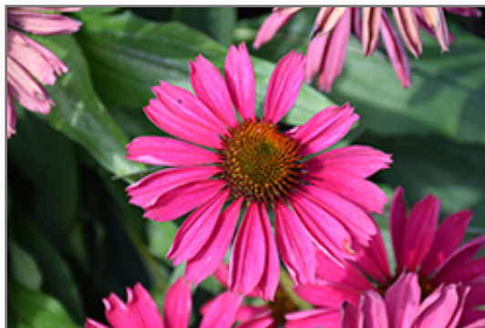
Kismet Raspberry Coneflower flowers