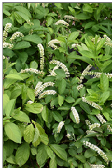
Scentlandia Virginia Sweetspire flowers

Scentlandia Virginia Sweetspire is recommended for the following landscape applications;