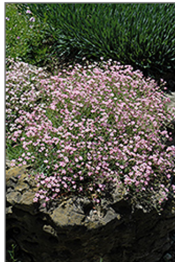
Pink Creeping Baby's Breath in bloom