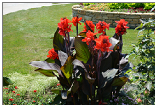
Toucan Scarlet Canna in bloom