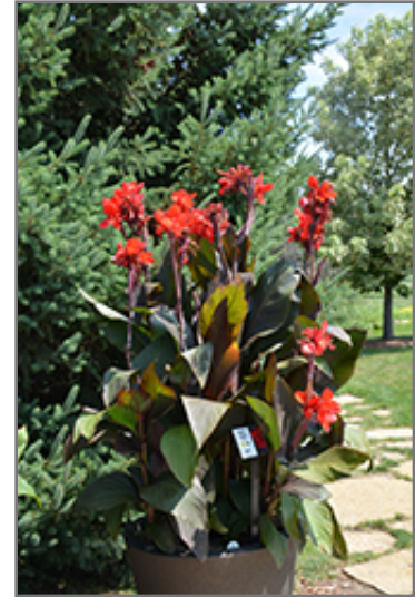
Toucan Scarlet Canna in bloom

Toucan Scarlet Canna is a fine choice for the garden, but it is also a good selection for planting in outdoor pots and containers. With its upright habit of growth, it is best suited for use as a 'thriller' in the 'spiller-thriller-filler' container combination; plant it near the center of the pot, surrounded by smaller plants and those that spill over the edges. It is even sizeable enough that it can be grown alone in a suitable container. Note that when growing plants in outdoor containers and baskets, they may require more frequent waterings than they would in the yard or garden. Be aware that in our climate, this plant may be too tender to survive the winter if left outdoors in a container. Contact our experts for more information on how to protect it over the winter months.