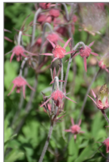
Prairie Smoke flower buds