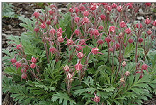
Prairie Smoke in bloom