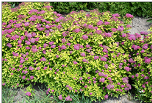
Double Play Gold Spirea in bloom