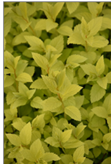
Double Play Gold Spirea foliage

This shrub should only be grown in full sunlight. It prefers to grow in average to moist conditions, and shouldn't be allowed to dry out. It is not particular as to soil type or pH. It is highly tolerant of urban pollution and will even thrive in inner city environments. This is a selected variety of a species not originally from North America.