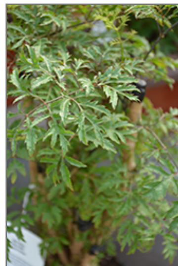
Ming Aralia foliage