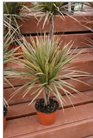
Colorama Dracaena in full

When grown indoors, Colorama Dracaena can be expected to grow to be about 3 feet tall at maturity, with a spread of 24 inches. It grows at a medium rate, and under ideal conditions can be expected to live for approximately 10 years. This houseplant performs well in both bright or indirect sunlight and strong artificial light, and can therefore be situated in almost any well-lit room or location. It does best in average to evenly moist soil, but will not tolerate standing water. The surface of the soil shouldn't be allowed to dry out completely, and so you should expect to water this plant once and possibly even twice each week. Be aware that your particular watering schedule may vary depending on its location in the room, the pot size, plant size and other conditions; if in doubt, ask one of our experts in the store for advice. It is not particular as to soil type or pH; an average potting soil should work just fine.