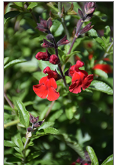
Radio Red Autumn Sage flowers