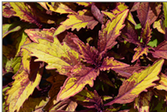
FlameThrower Spiced Curry Coleus foliage