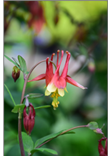
Wild Red Columbine flowers

Wild Red Columbine is recommended for the following landscape applications;