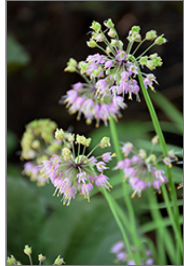
Nodding Onion flowers

This plant should only be grown in full sunlight. It does best in average to evenly moist conditions, but will not tolerate standing water. It is not particular as to soil type or pH, and is able to handle environmental salt. It is highly tolerant of urban pollution and will even thrive in inner city environments. This species is native to parts of North America. It can be propagated by multiplication of the underground bulbs.