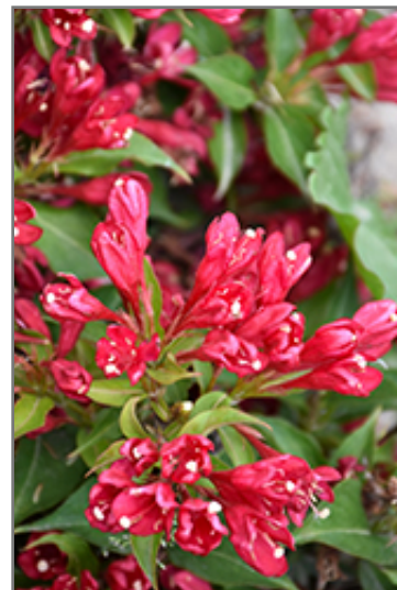
Crimson Kisses Weigela flowers