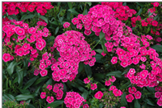
Jolt Pink Hybrid Pinks flowers

Jolt Pink Hybrid Pinks is recommended for the following landscape applications;