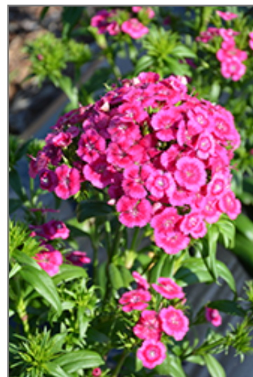
Jolt Pink Hybrid Pinks flowers