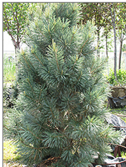
Vanderwolf's Pyramid Pine